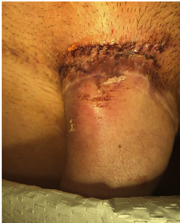
Figure 3. Proximal malposition. 9 days after inflatable prosthesis placement, patient presented with concerning dorsal penile bulge and mild erythema roughly 1 cm distal to the incision site. This form of minor malposition occurs when the prosthesis partially lifts out of the phallus when inflated. Although unsightly, this problem is easily remedied by applying firm pressure with the palm on the lower pubis just superior to the phallus. This defect eventually healed, no longer requiring this maneuver, and the patient reported a satisfactory outcome at follow-up. Figure 3 is available in color online at www.jsm.jsexmed.org .

and non-inflatable complication rates were 45.2% and 41.5%, respectively (Table 5). These rates were increased due to the exclusion of 5 articles that used both inflatable and non-inflatable prostheses but did not stratify complications by prosthesis type. 6,11,13,19,32 However, these complication rates are in line with the complication rates published in the larger retrospective studies. 2,4,12 Due to the status of the literature, it was infeasible to compare complication rates and time to implant after phalloplasty. Surprisingly, no study reported any patients suffering from flap loss after prosthesis insertion. This is likely due to most surgeons opting for a staged approach, waiting until the neophallus has healed and regained sensation before prosthesis insertion. In Figure 5, an example of a postoperative infection requiring implant removal is seen.