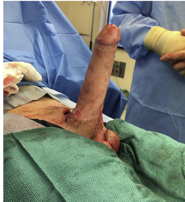
Figure 2. Satisfactory placement in trans masculine patient. This demonstrates intraoperative placement of a single cylinder Coloplast Titan via a suprapubic approach into a radial forearm free flap neophallus. The pump is placed into the left hemiscrotum, and the right hemiscrotum has a Coloplast Torosa implant. Figure 2 is available in color online at www.jsm.jsexmed.org .

**Total adjusted to report number of patients with complications; rate adjusted to include malpositioning as a complication (originally reported as 41.1%).