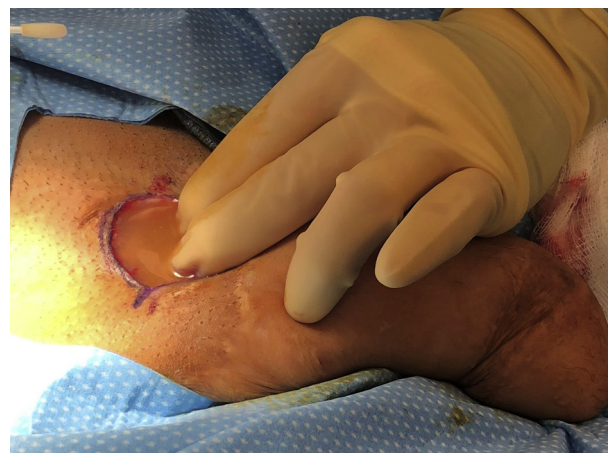
Figure 5. Implant infection. Patient presented after surgery with pain and suprapubic swelling after placement of dual cylinder semi-rigid implants, surrounded with Gore-Tex arterial grafts. During an exploratory operation, 200 mL of milky yellow fluid was discovered around the base of both prostheses. Intraoperative cultures were negative, but the patient received intravenous vancomycin and gentamycin before surgery. Patient tolerated removal of the prosthetic and will be reimplemented after a 6-month waiting period. Figure 5 is available in color online at www.jsm.jsexmed.org .